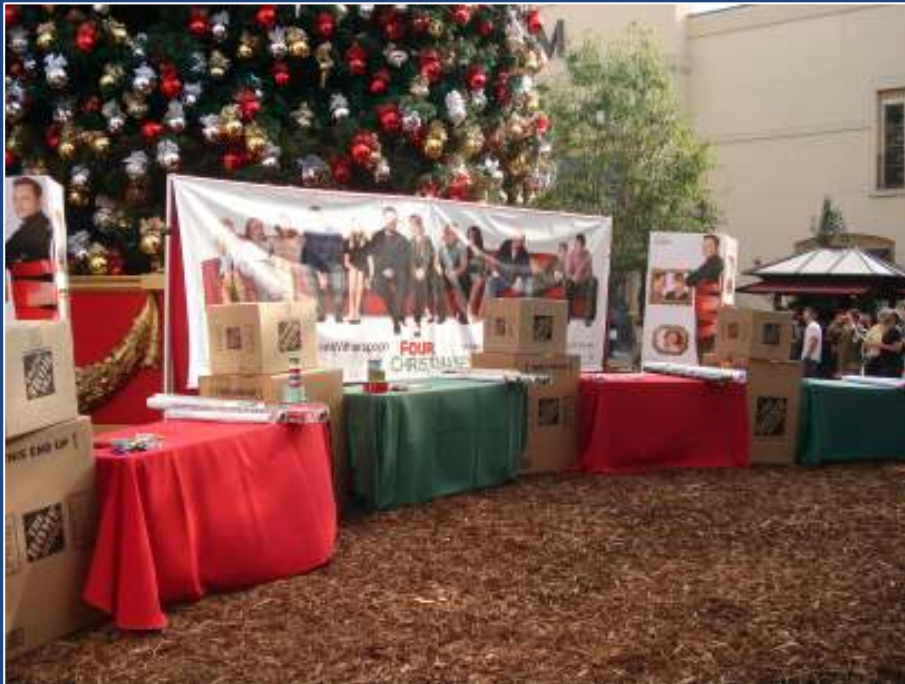
Setup for Four Christmases Promotional Event in Town Square