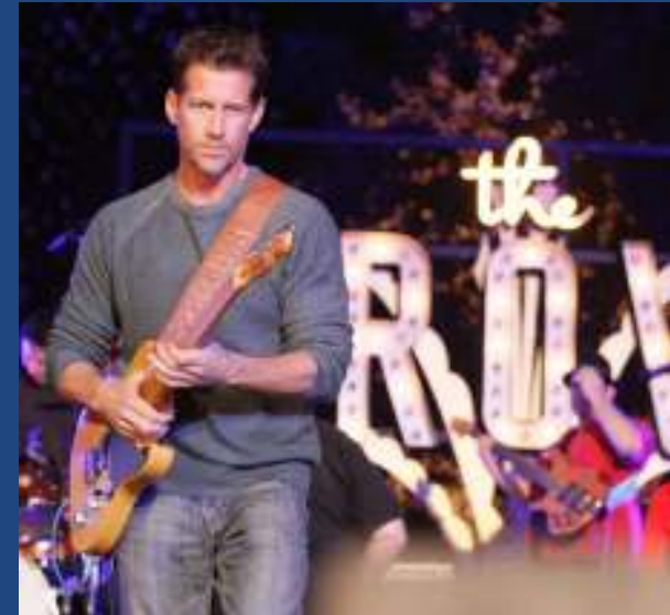
The Band from TV