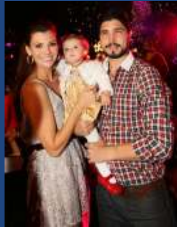
Ali Landry and Family