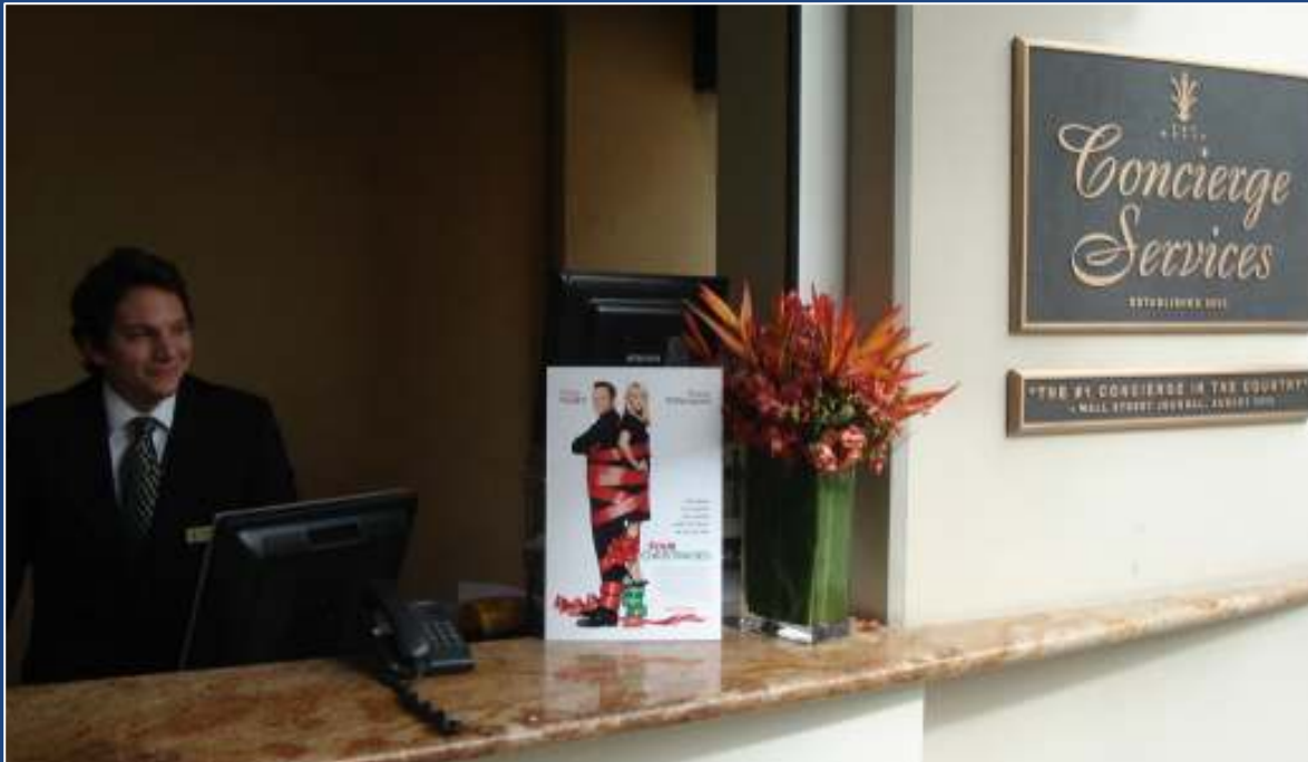
Counter Card at Concierge Desk *Added Value