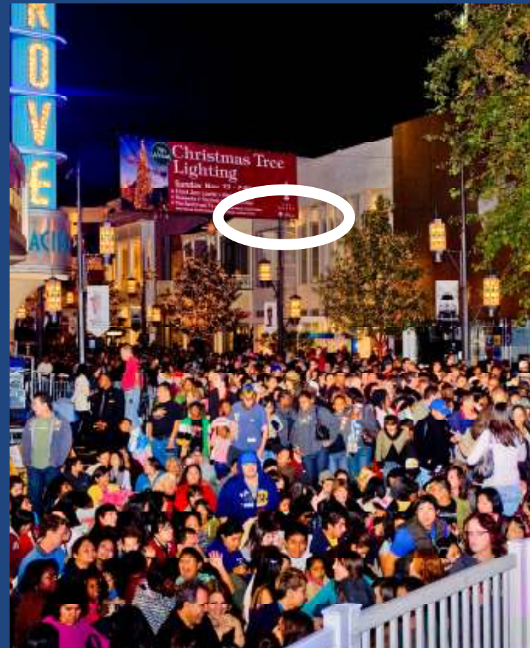
Logo Inclusion on 22" x 28" signs & Cross Street Banner