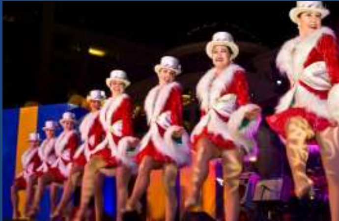
The Top Hats