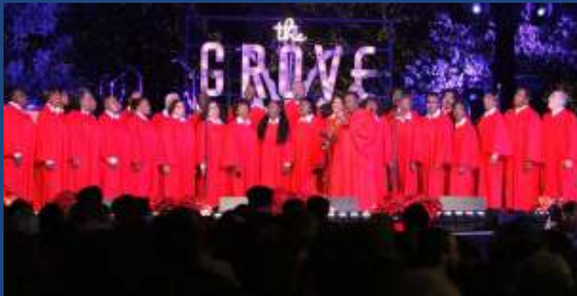
HB Barnum & Life Choir