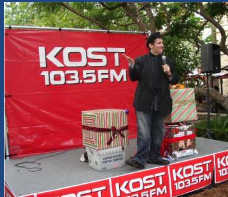
Stage in Town Square For Four Christmases Event

A Four Christmases Publicity Stunt was promoted and attended by KOST 103.5 and engaged Guests for more than an hour on “Black Friday”, November 28, the busiest shopping day of the year. *Added Value