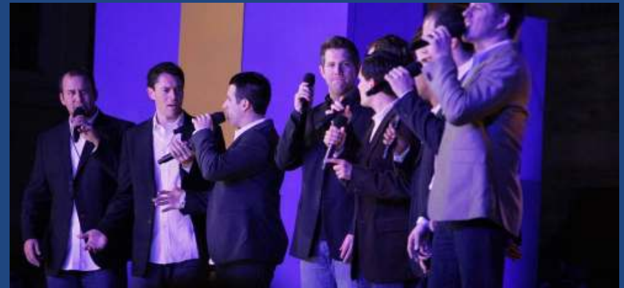
Straight No Chaser