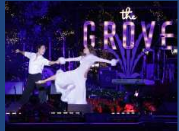
Dancing with the Stars