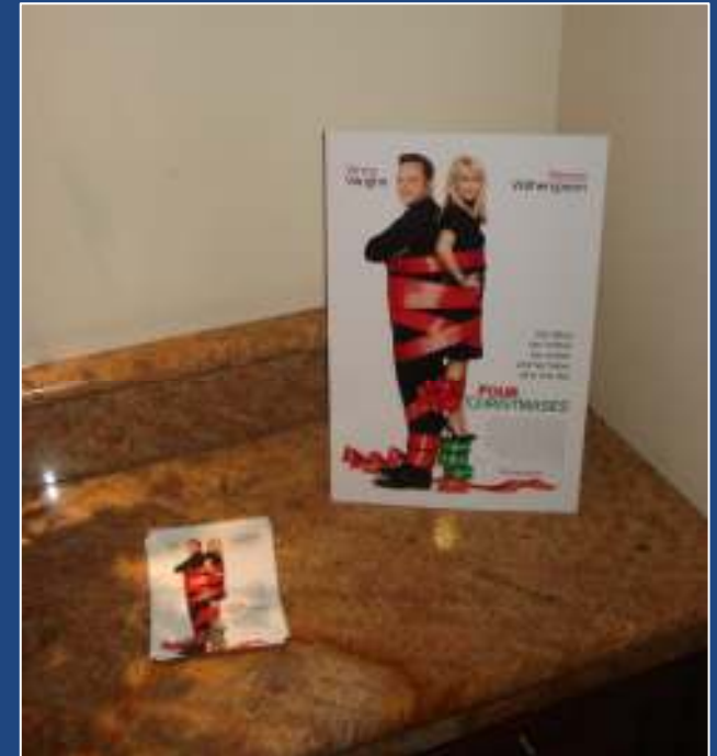
Counter Card & Flyers in Restrooms *Added Value