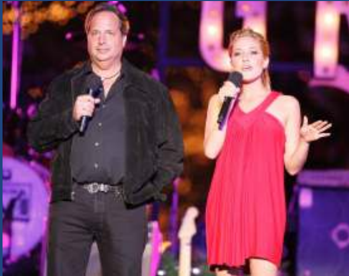
Jon Lovitz & Kristin Cavallari